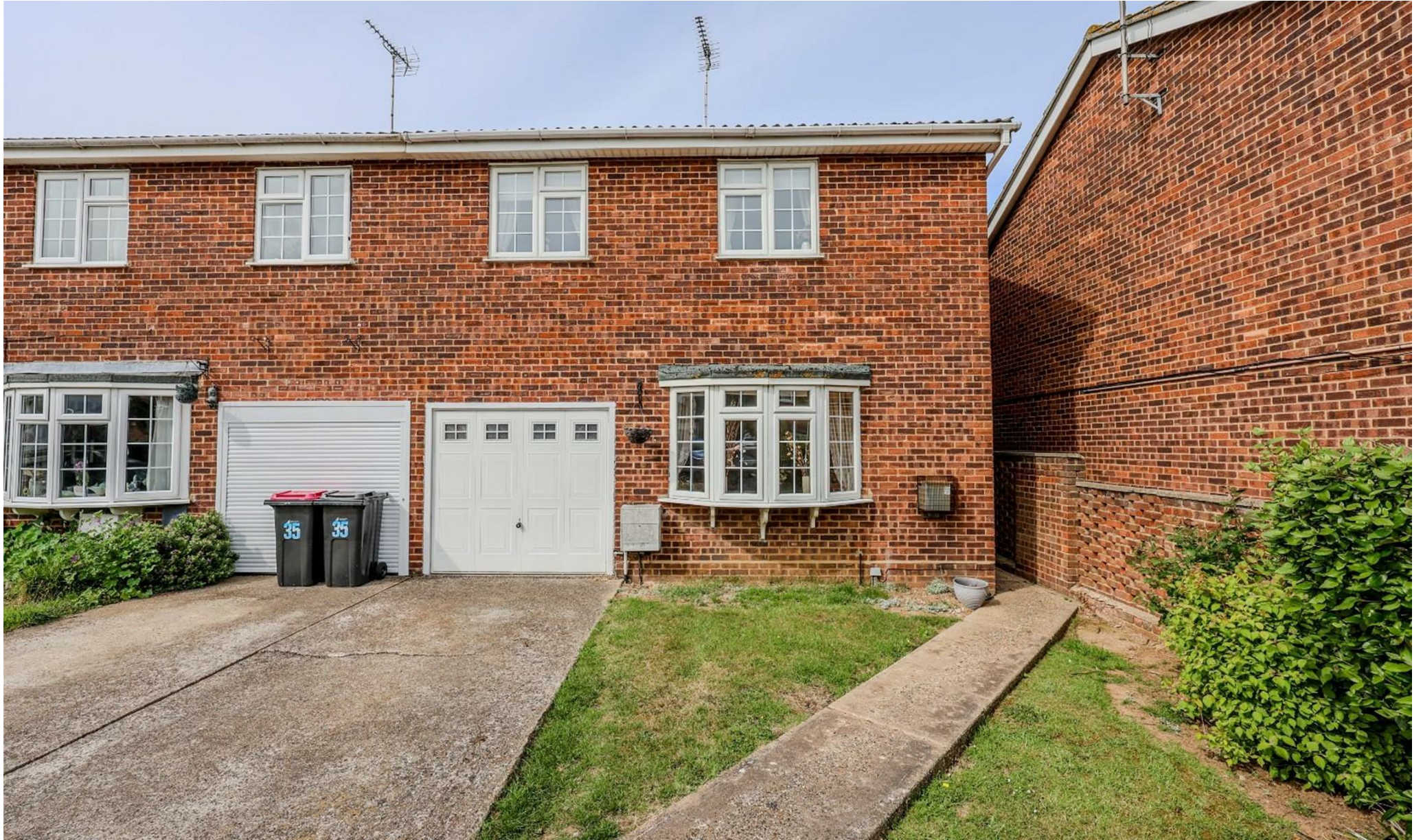
Collins Way, Leigh-On-Sea £375,000